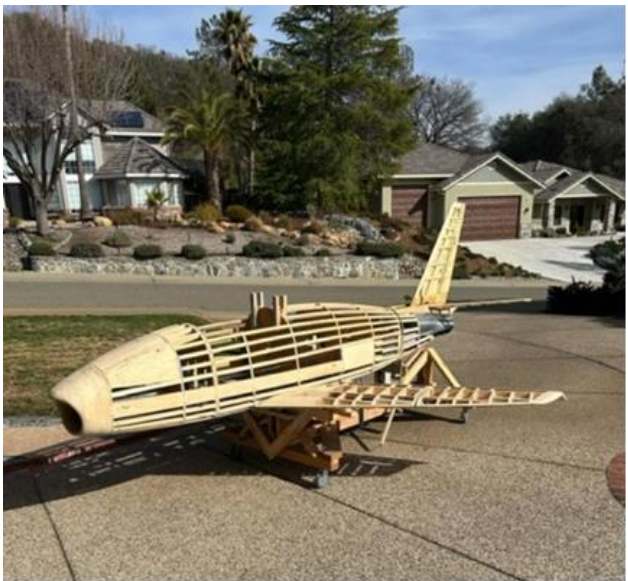
F-86 Saber (Parade Plane) Under Construction

Jerry is currently scratch building another “parade plane” (means it won’t fly). This one is